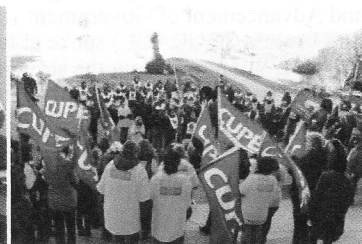
Rallying at the steps of the Legislature