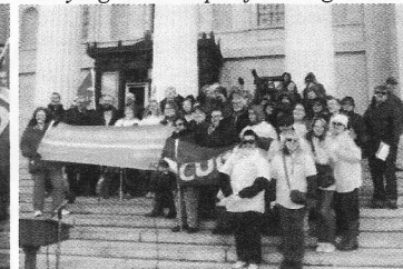
CUPE Members Rallying

THANK YOU TO ALL WHO HELPED MAKE THIS GREAT EVENT POSSIBLE!