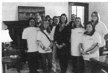
Meeting with the Minister of Health